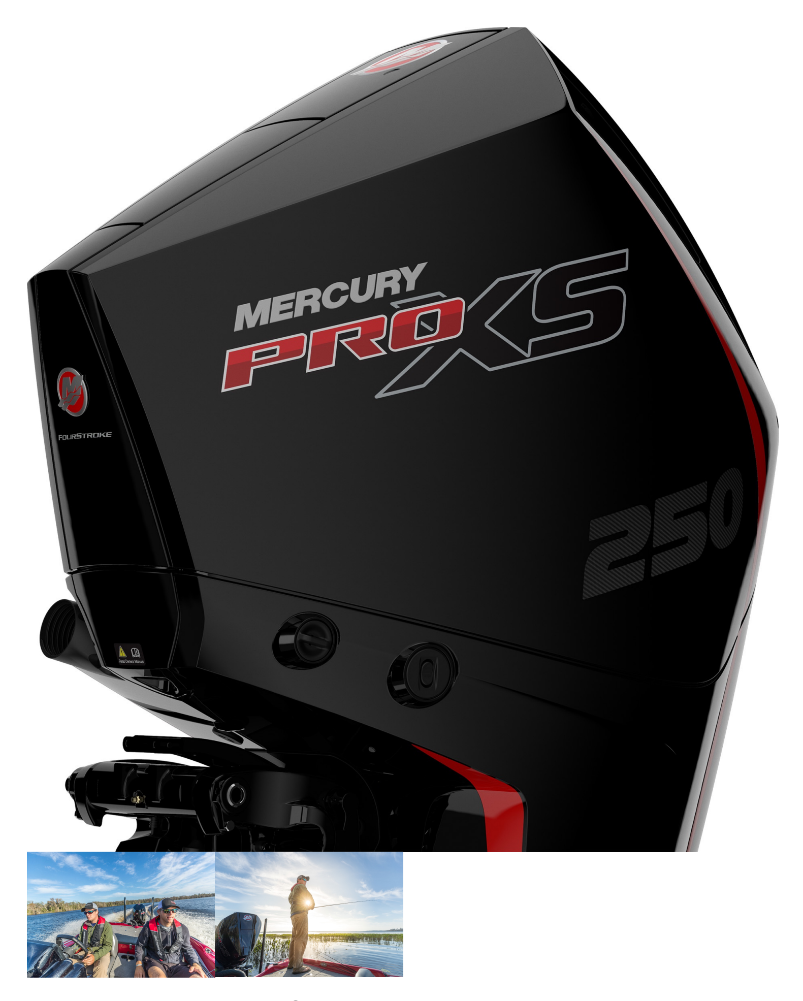
2023 Mercury 250 HP Pro XS