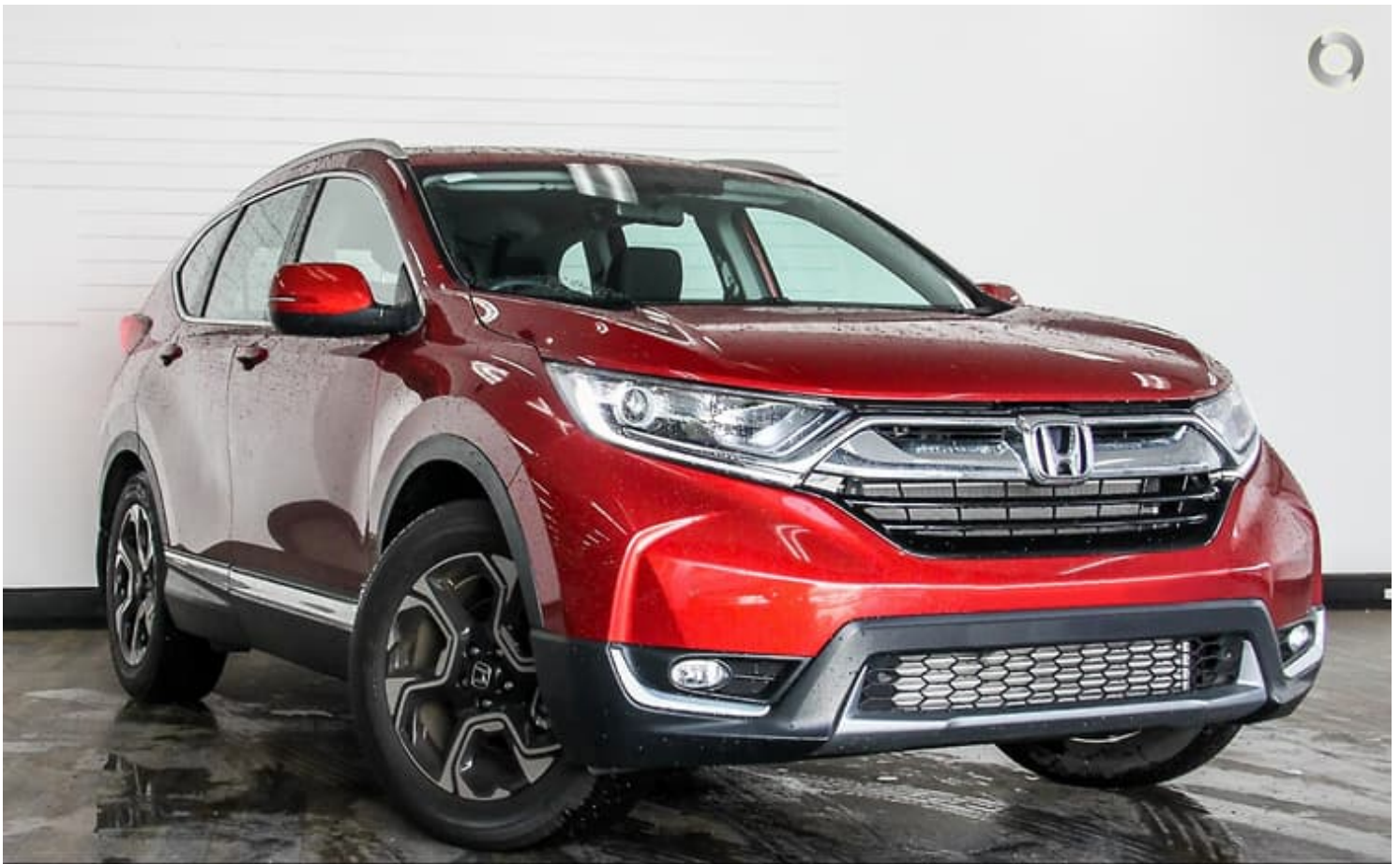
Sample - Not actual vehicle