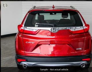
Sample - Not actual vehicle