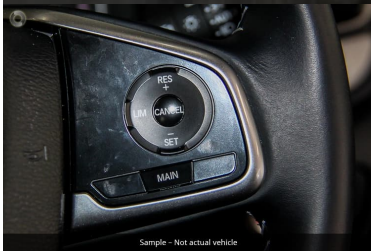
Sample - Not actual vehicle