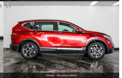
Sample - Not actual vehicle